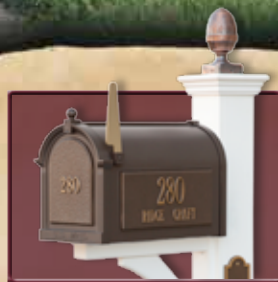
Mailbox Posts & Mailboxes