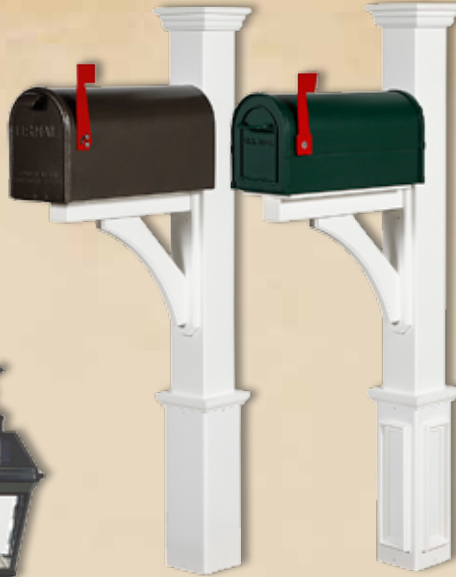
Salem 5" Sq. x 60" High w/ Boxed Base