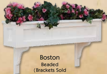
Boston Beaded (Brackets Sold Separately)