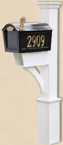
Dover PLUS w/ Newspaper Box 5½" Sq. x 60" High w/ Boxed Base

Count on "special delivery" every day when you add a beautifully crafted mailbox post and mailbox to your outdoor décor. It's the perfect balance of function and Style. Quality built to stand strong and sturdy through the seasons. Each design is manufactured solely of cellular-pvc board to ensure you of lasting beauty & durability for many years.