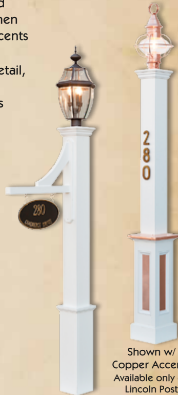
Shown w/ Vinyl Sign Bracket & Oval Sign Available on all posts