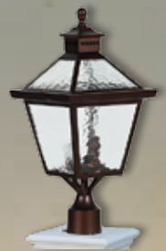
Baystreet 10" Sq. x 21" High