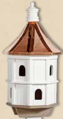
Condo 12" Sq. x 28" High