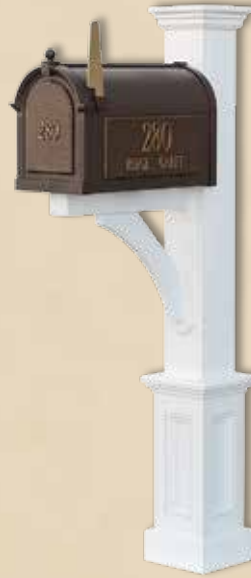
Madison 5½" Sq. x 60" High w/ Raised Panel Base