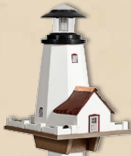
Lighthouse 12" W x 14½" L x 22" H