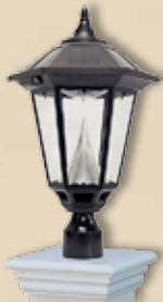
Windsor Solar Lantern 10½" Sq. x 20"H