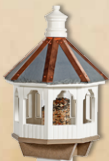
Gazebo 12" Sq. x 22" High