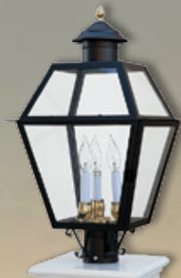
Lexington 13" Sq. x 24½" High