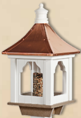
Cupola 12" Sq. x 28" High