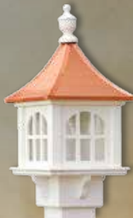
Copper Cupola Lantern 14" Sq. x 24" High