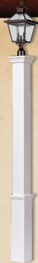
Jefferson 5" Sq. x 76" High w/ Boxed Base