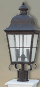
Chatham 9" Sq. x 22½" High