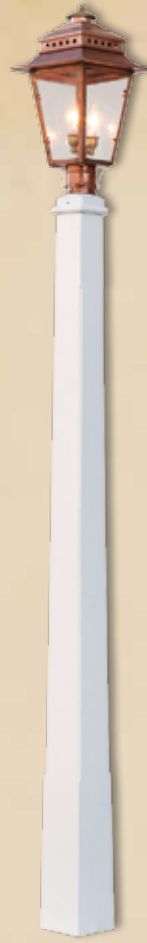
Richmond 5½" Sq. x 76" High Tapered