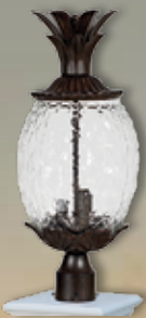
Lanai 10" Sq. x 22½" High