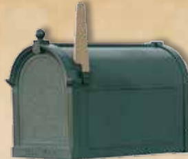
Whitehall Aluminum 10"w x 13"h x 21"d