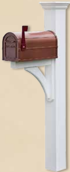
Annapolis 5½" Sq. x 60" High