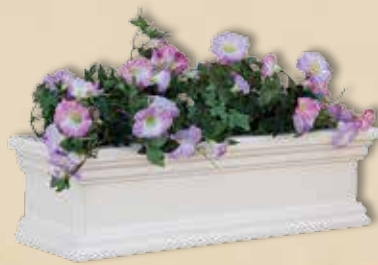
Albany Standard with Decorative Trim

What a simple way to add curb appeal! Choose from a wide variety of beautifully crafted planters and window boxes designed to make it easy to accent your home with color and style. Constructed with quality materials and available in a full range of sizes and designs, you're sure to find the perfect look to give your home a special finishing touch.