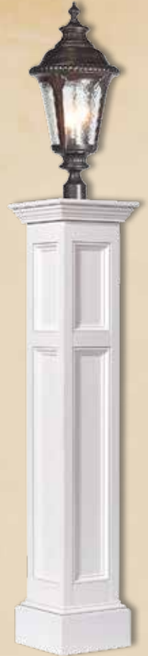
Providence 10" Sq. x 64" High with Raised Panel