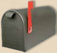
Newport Metal 9"w x 11"h x 21"d