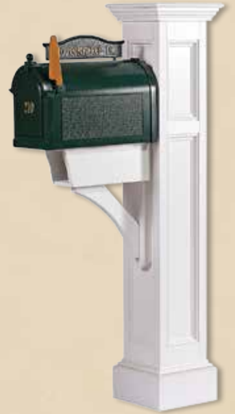
Providence (Optional Newspaper Box) 10" Sq. x 64" High w/ Raised Panel