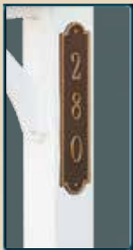
Vertical Address Sign