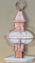
Copper Onion 11½" Sq. x 18½" High