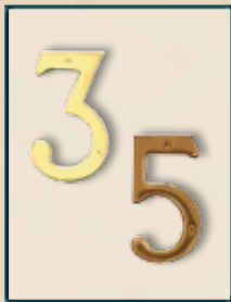
Polished Brass or Antique Brass Address Numbers