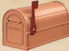
Rural Aluminum 8"w x 10"h x 21"d