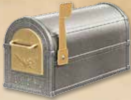
Eagle Aluminum 8"w x 10"h x 21"d