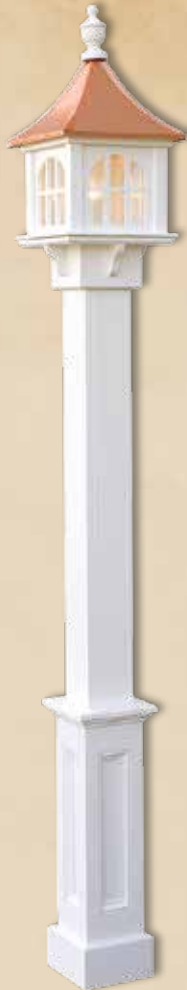
Lincoln 5½" Sq. x 76" High with Raised Panel Base