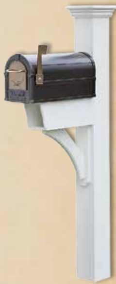
Annapolis PLUS w/ Newspaper Box 5½" Sq. x 60" High