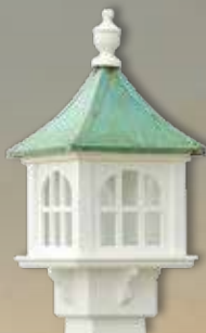
Patina Cupola Lantern 14" Sq. x 24" High