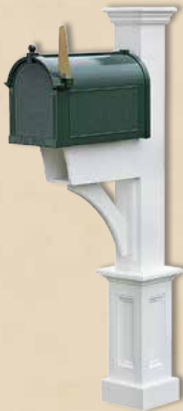
Madison PLUS w/ Newspaper Box 5½" Sq. x 60" High w/ Raised Panel Base