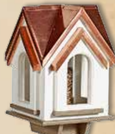
Mansion 12" Sq. x 20" High