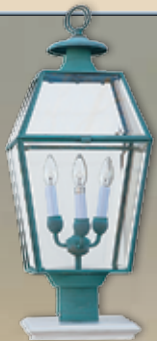
Olde Colony 11" Sq. x 29½" High