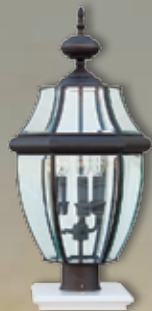
Lancaster 11½" Sq. x 24" High