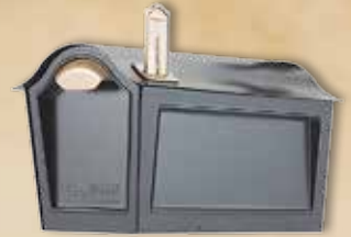
Chalet Metal 11"w x 12"h x 21"d