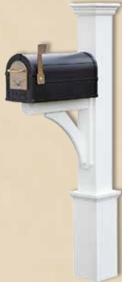
Dover 5½" Sq. x 60" High w/ Boxed Base