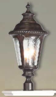
Surrey 12" Sq. x 26½" High