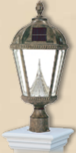
Royal Solar Lantern 9" Sq. x 23"H

Choose one of our "Eco-Posts" as an economical choice of our Lamp & Mailbox posts. These posts are made with a vinyl post sleeve and capped with cellular pvc moldings. Add one of our attractive "Solar Lanterns" and you will have maintenance free beauty for many years.