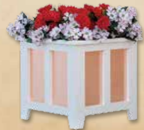
Sante Fe (Shown with Copper Accents)