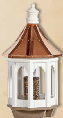
Victorian 12" Sq. x 28" High