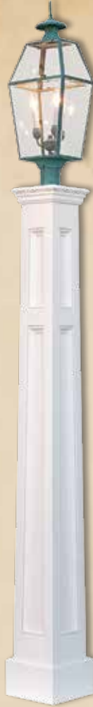
Trenton 7½" Sq. x 76" High Tapered with Raised Panel