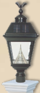
Imperial Solar Lantern 10½" Sq. x 23½"H