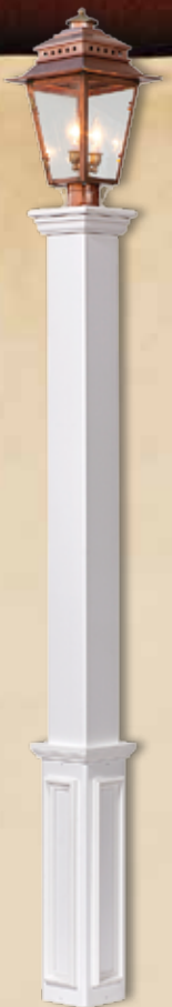
Springfield 5" Sq. x 76" High w/ Boxed Base & Trim