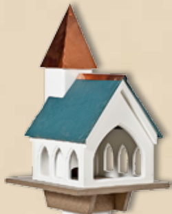
Chapel 12" W x 14½" L x 22" H