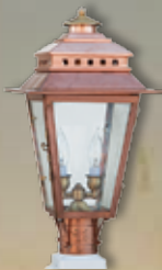
New Orleans 10½" Sq. x 19" High