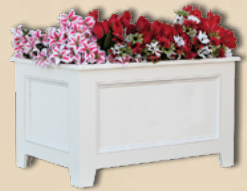
Denver Raised Panel